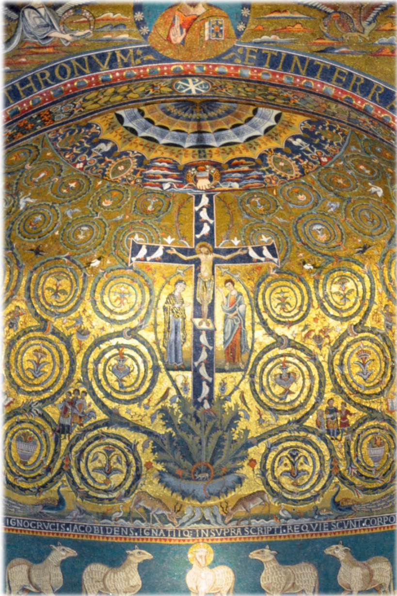
Tree of Life Cross

April 28, 2024, 8:00 and 10:30 am Worship Services