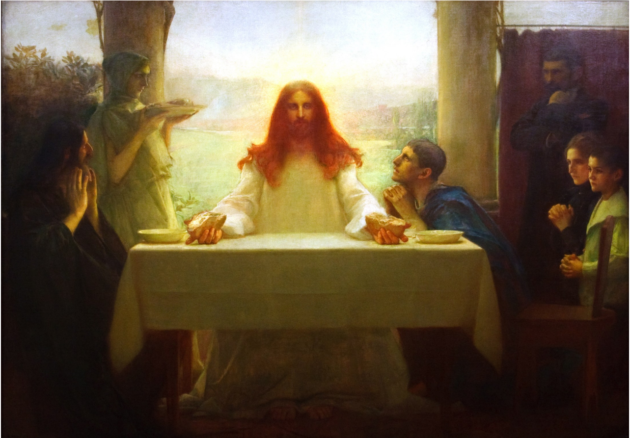
Christ and The Disciples at Emmaus

April 19, 2026, 8:00 and 10:30 am Worship Services