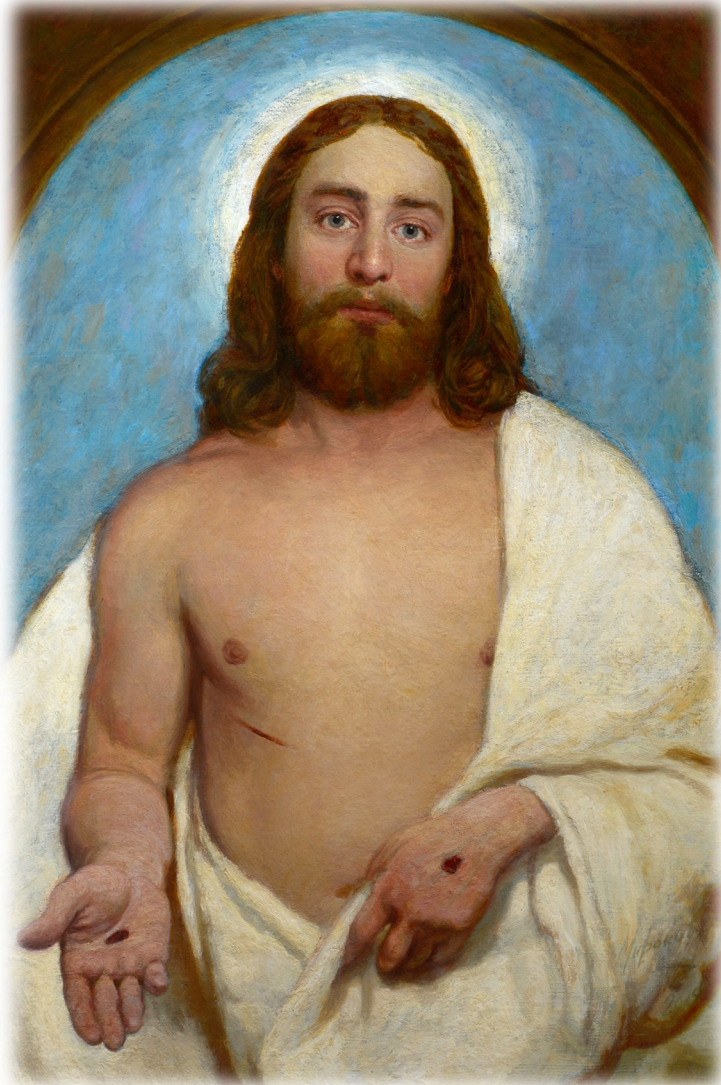
The Unbelief of St. Thomas

April 12, 2026, 8:00 and 10:30 am Worship Services