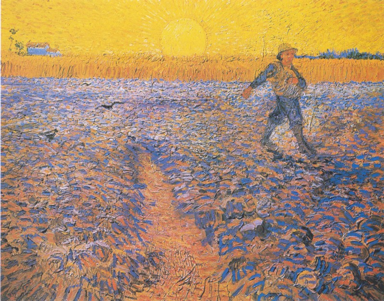
Sower at Sunset

July 12, 2026, 8:00 and 10:30 am Worship Services