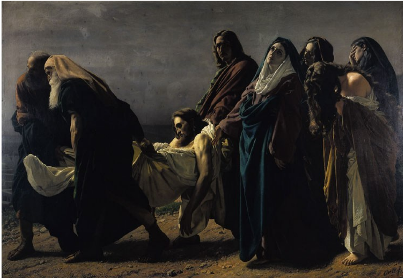
The Transport of Christ to the Sepulcher

~ April 13, 2025, 8:00 and 10:30 am Worship Services ~